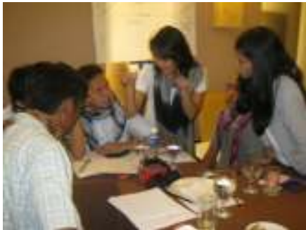
Integral Development Services — North Cotabato