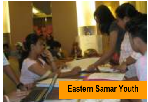
Eastern Samar Youth