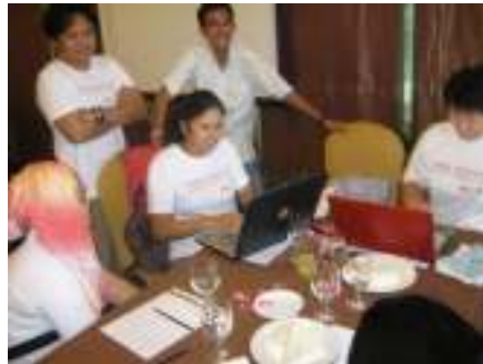
Red HAT — Laguna