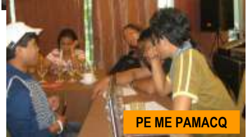
PE ME PAMACQ