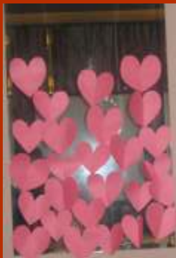
Hearts of Hopes and Concerns

The concerns of the participants were varied and in many ways similar. Most revolved around family they left behind. One had a birthday today but she came and left her children behind. A wife is about to give birth to their first child, for one, it was his first time to leave his wife. Two worried about the meals of siblings. One dropped the household survey he was conducting. One left behind his